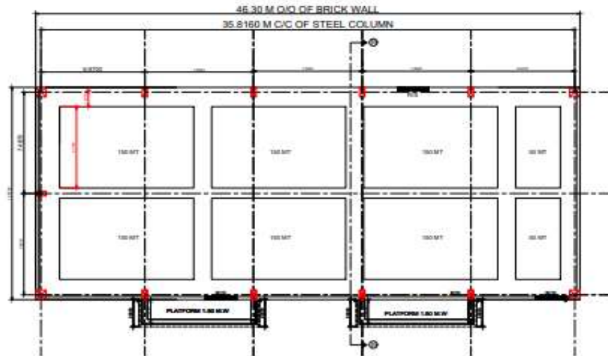
GODOWN PLAN scale 1:100 SIZE 46.3 M X 22.24 M X 6.20 M